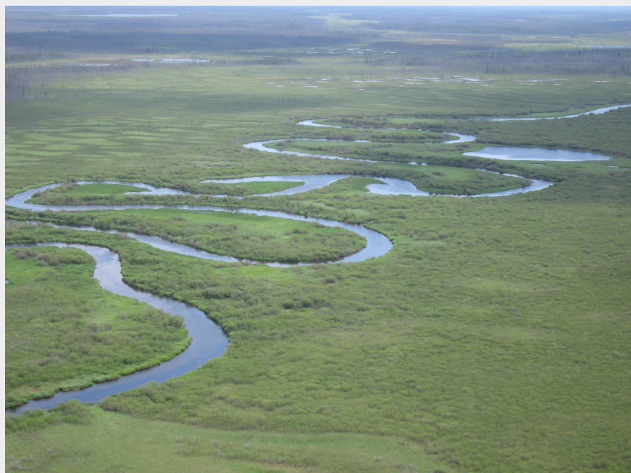
Edézhíe Protected Area, Northwest Territories.

IPCAs can count towards Canada Target 1 when they are recognized as a Protected Area or an OECM following guidance found in the One with Nature report. Work is ongoing with Indigenous peoples at many levels across Canada to further elaborate the concept of Indigenous Protected and Conserved Areas (IPCAs), and to clarify their contributions to Canada Target 1 as well as to Indigenous cultural, social and conservation priorities. This is being done in the spirit and practice of reconciliation; in ways that respect existing federal, provincial and territorial government approaches; and consistent with legal duties and mutual commitments in treaties, land claim and self-government agreements, as well as other agreements as required.