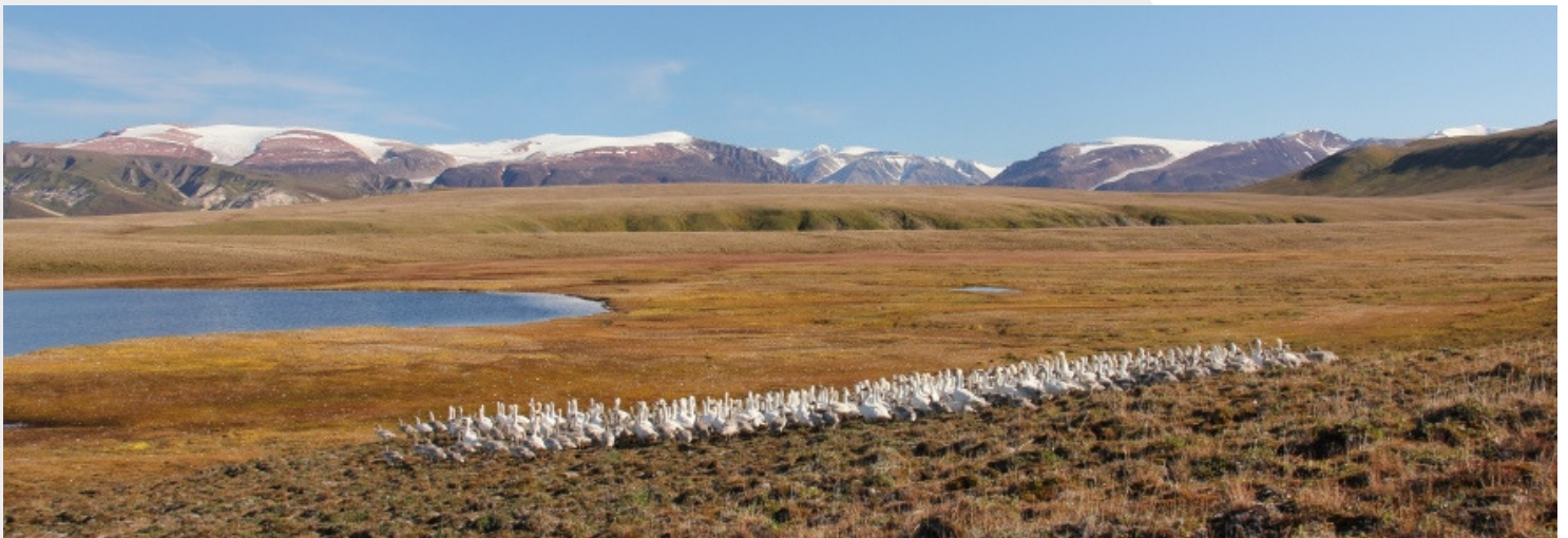
Bylot Island Migratory Bird Sanctuary, Nunavut.

Other areas, including Indigenous Protected and Conserved Areas (IPCAs), privately owned conservation lands, areas protected through Indigenous land claim agreements, and traditional use planning areas, among others. Specific examples include the Edézhíé Protected Area, and Jenkins Woodlands Natural Area.