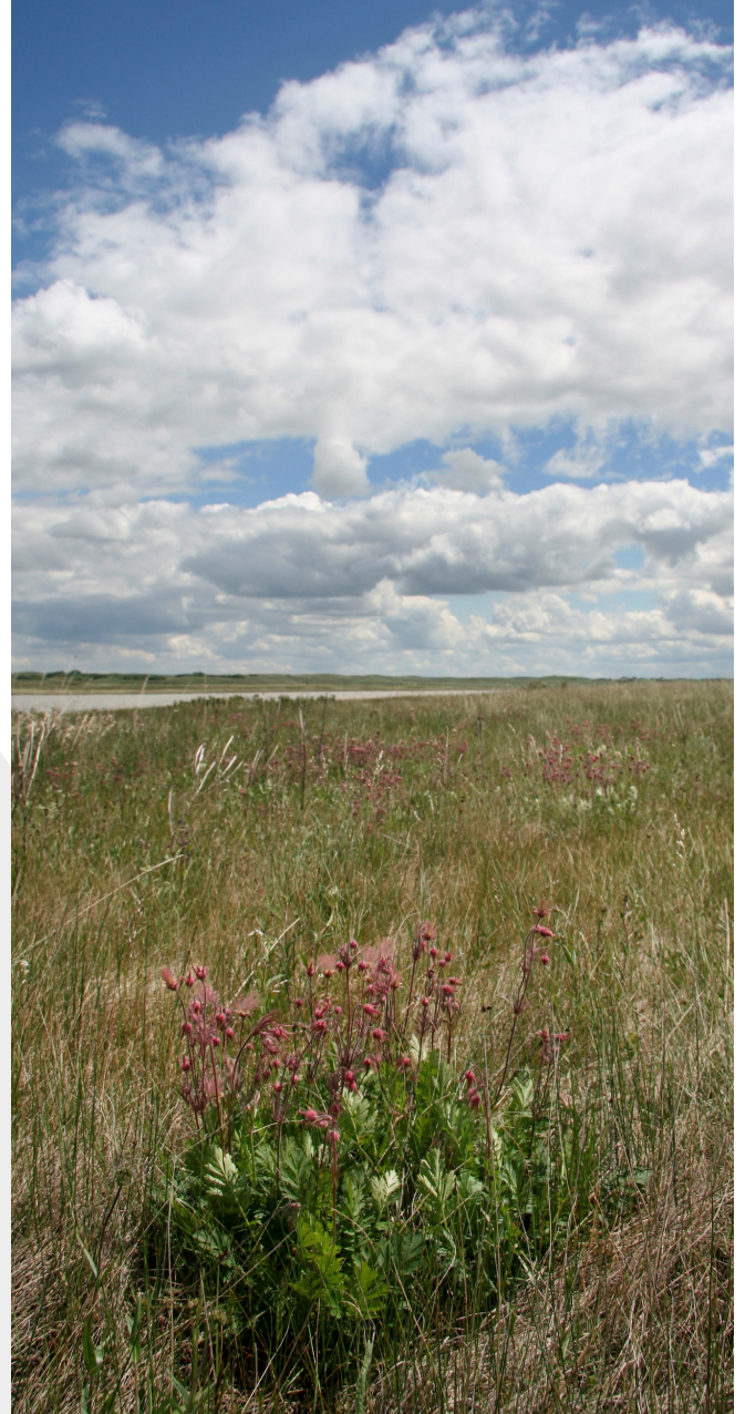
Spiers Lake, Alberta.