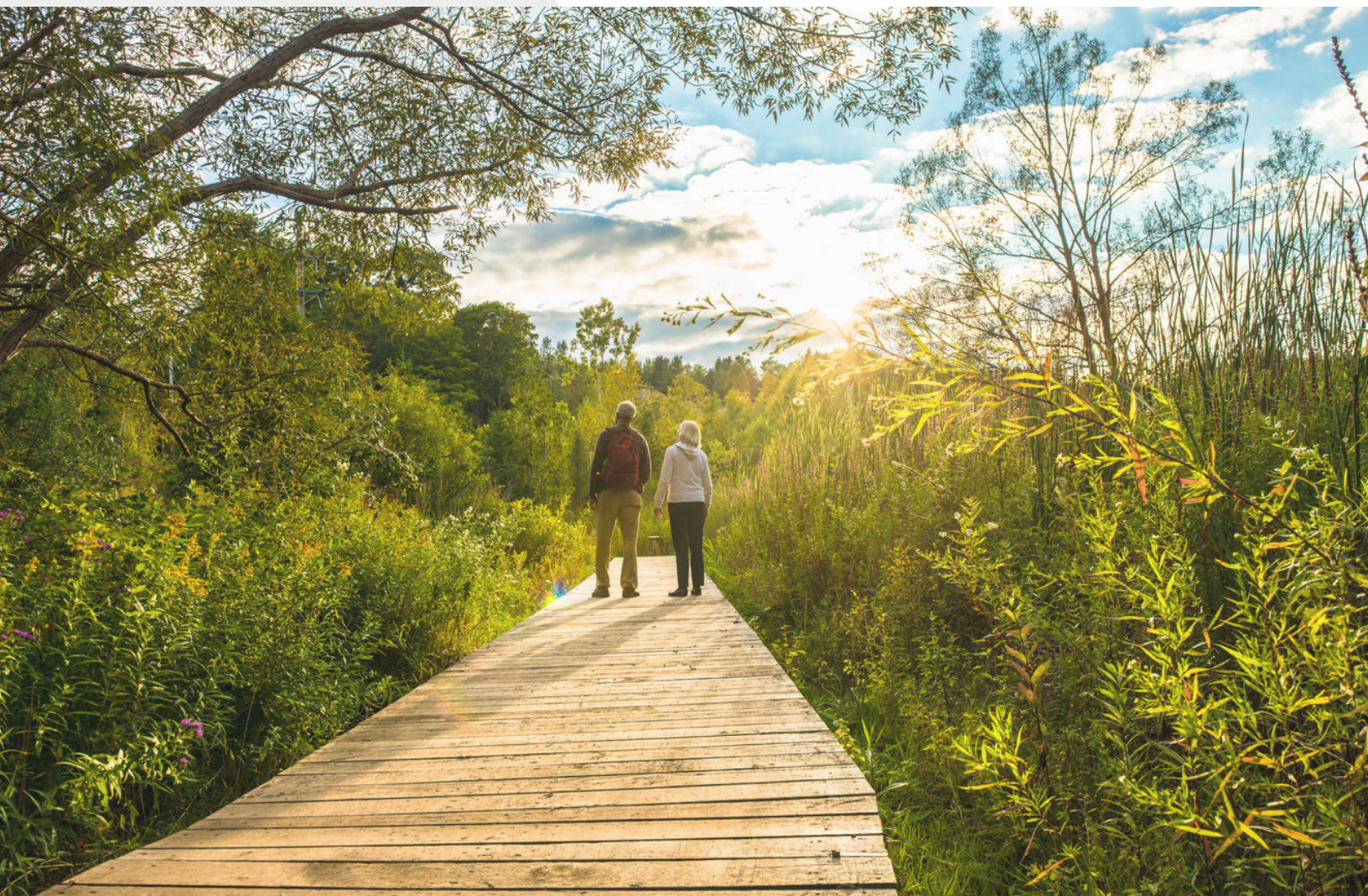
Rouge National Urban Park, Ontario.